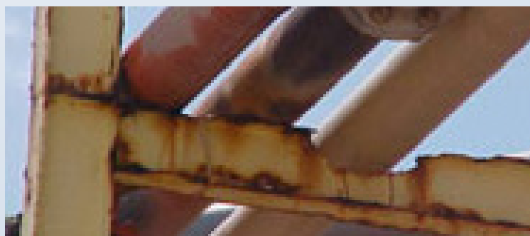
Pipe conditions without APS Raq-Gard®

Ribbed underside provides for better adhesion characteristics. Tests indicate RAQ-GARD® has more load bearing capacity than other products.